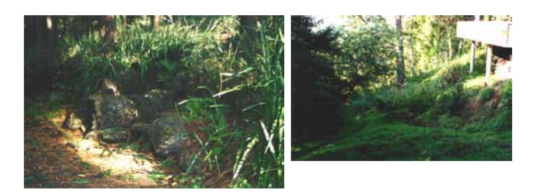
Figure 10 (left): View of the Formal Garden spring that drains through the grotto and into the rectangular pool.

Garden spring is piped into the grotto, travels along a concrete-lined runnel and into the reflecting pool before it is finally piped into the northwest stream (Figure 10). As previously discussed, this spring may be a function of the Hayward fault. The perennial spring in the Australian Hollow outlets from a pipe placed in the side of the slope (Figure 11). Mr. Norcross was able to pipe the water produced from the spring into a plastic reservoir throughout the duration of the drought in the late 1980s and early 1990s (personal communication, 1999). I have previously suggested that quarrying may have occurred in the Australian Hollow area; such quarrying may have exposed the spring located there.