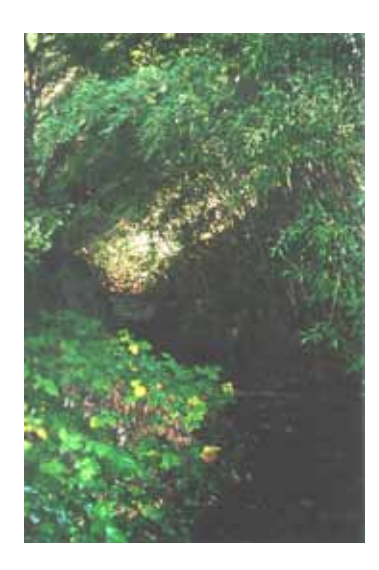
Figure 2 (left): Looking downstream of the northwest stream. Figure 3 (right): Looking upstream of the southeast stream.