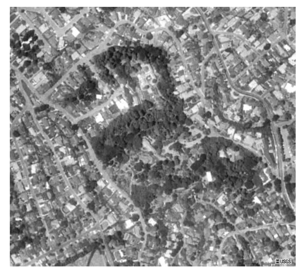
Mapped Traces of the Hayward fault

Dibblee (1980) Solid line represents inferred location of the fault, dotted line represents where the fault is concealed. Smith (1980) Solid line represents inferred location of the fault, dashed line represents where the fault location is uncertain. Lienkamper (1992) Dashed line represents inferred location of the fault, hachures indicate the lower side of apparent vertical displacement. Depression observed in the 1939 aerial photos by the author Boundary of the Blakemont Landslide (Seidelman Associates 1994)