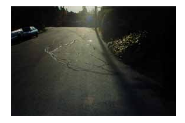
Figure 6 (above): View to the southeast along Highgate Road. The residence at 18 Highgate Road is to the right. Note arcuate cracks in the asphalt, which represent small-scale deformation within the Blakemont landslide.