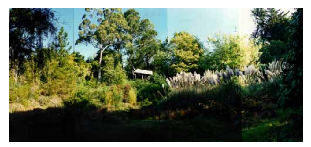
Figure 8: View to the north of the Australian Hollow area. Note cattails in the right midground, which favor moist to wet soil conditions. These soil conditions are likely a function of the bowl-shaped topography and the Australian Hollow spring. Steep slopes in the background are up to 90% grade.

Unfortunately, I did not find any historic information regarding the use or placement of fill during the construction of the estate. However, it appears that fill was placed at the downslope, or southern, sides of both parking lots, as well as along the streamside edge of the four-square magnolia garden of the Cut-Flower Garden.