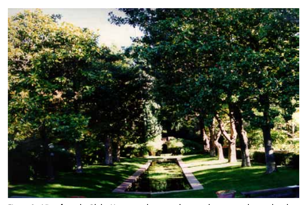
Figure 1: View from the Blake House northeastward across the rectangular pool to the grotto.

The site is bound by Rincon Road on the northeast, Highgate Road on the southwest, a Carmelite monastery on the northwest, and single-family residences on the southeast (Plate 1). The estate is commonly divided into six areas: the Entrance, the Cut-Flower Garden, the Australian Hollow, the West of the House, the Redwood Canyon, and the Formal Garden. The Entrance includes Rincon Road, two parking lots, and the entrance drive leading to Blake House. The Cut-Flower Garden is located in the eastern corner of the site and includes a horticultural production area, greenhouse, a small storage structure for gar-