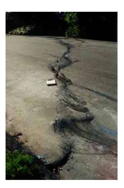
Figure 7 (right): View to the south across Highgate Road near 16 Highgate Road. Crack in asphalt is up to 3 inches wide. A driver of a car passing by while I took this photo said that the road was resurfaced two years ago. Clipboard for scale.