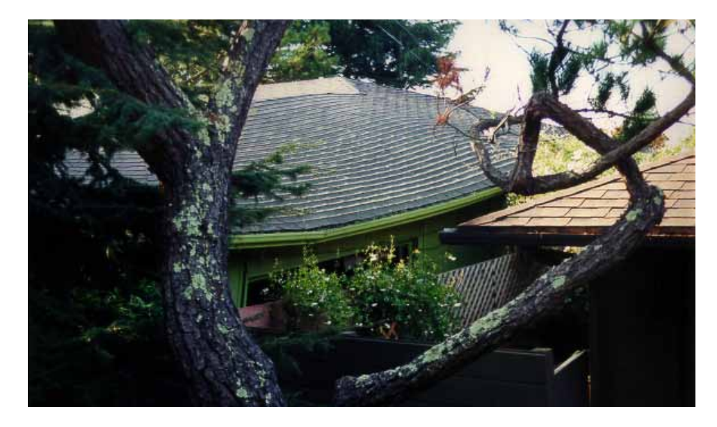
Figure 5: View of landslide-induced distress to the residence at 18 Highgate Road. Note the warped roof and cracks along the side of the residence.